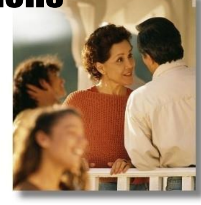
table. Try the following tips to help make your get-togethers a little merrier: 1) steer conversations that appear to be drifting into conflict toward those things you can agree on; 2) if you are angry about what's in the news, avoid displacing this tension onto loved ones; 3) challenge yourself to be a tension deescalator, not an aggravator; and 4) rehearse how you might respond to conflict because doing so will dramatically improve your ability to act calmly while avoiding hair-trigger reflexes.

The annual Stress in America survey consistently reports strain among families caused by their ideological differences, and the holidays have a keen reputation for these conflicts, even at the dinner